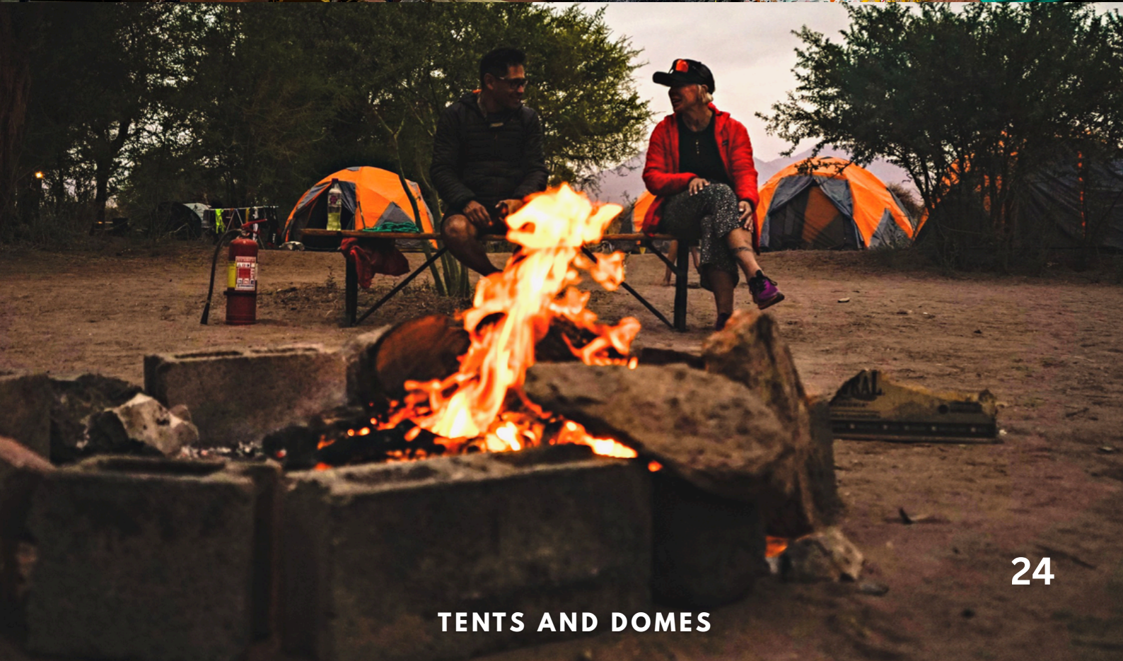
TENTS AND DOMES