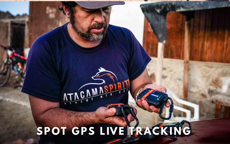
SPOT GPS LIVE TRACKING